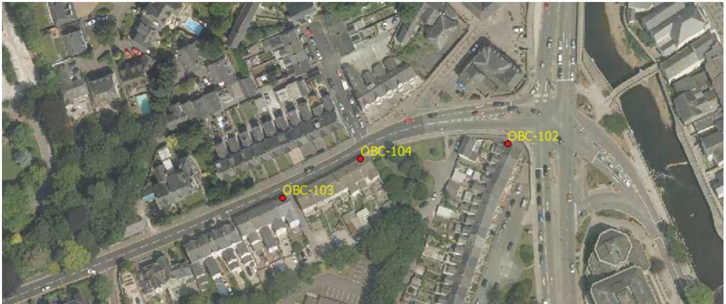
Figure 1 – 2017 Monitoring Locations on Park, Street, Bridgend

4.4 During 2018, monitoring for \text{NO}_2 has been increased further along Park Street, with an additional two \text{NO}_2 monitoring sites implemented. These will continue to be monitored. Figure 2 illustrates the current 2018 network of monitoring for Park Street including the additional two locations (OBC 109 and OBC 110).